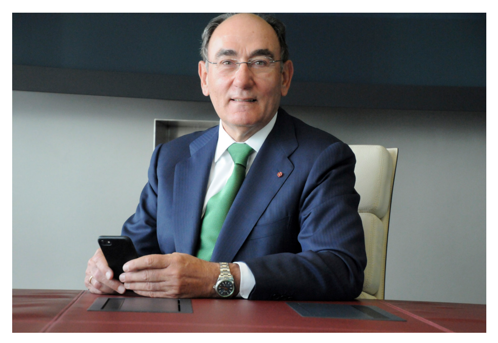
Ignacio Galán Chairman of Iberdrola

In a year marked by the energy crisis and difficulties in global supply chains, we have increased investments by 13% to almost 11,000 million euros to continue growing solidly, generating more activity and employment and reducing dependence on fossil fuels.