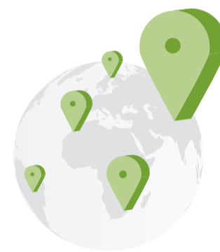
Serving more than 24GW in 14 countries