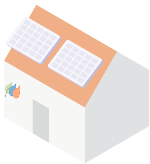
Integrated self-development system

Estimation of the electricity production of any renewable installation and weather forecasting at its sites