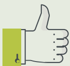
Code of ethics