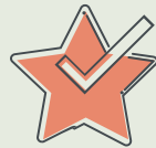
General CSR policy