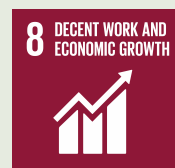
Decent work and economic growth