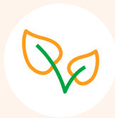
Impact on water and food supply