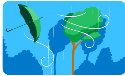
More extreme weather events