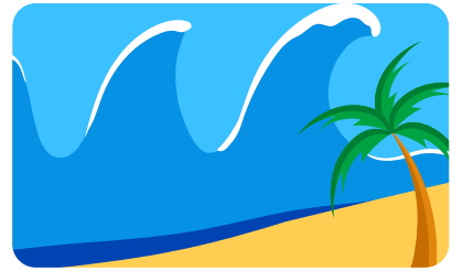
Climbing sea level