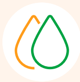
Impact on water quality