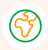
Changes in vector ecology