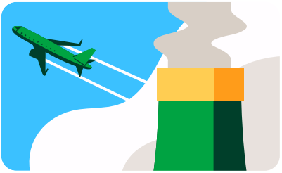
Rising CO 2 levels